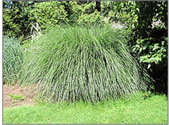
Yaku Jima Dwarf Maiden Grass

This plant will require occasional maintenance and upkeep, and is best cleaned up in early spring before it resumes active growth for the season. It is a good choice for attracting birds to your yard, but is not particularly attractive to deer who tend to leave it alone in favor of tastier treats. It has no significant negative characteristics.