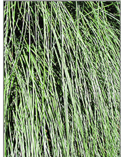
Yaku Jima Dwarf Maiden Grass foliage