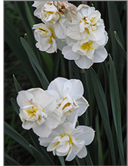
Cheerfulness Daffodil flowers

Wonderfully fragrant double white blooms touched with pale yellow centers; perfect for naturalizing; long-lasting cutflower; a reliable perennial with clumps that will multiply and spread over time; impressive when massed