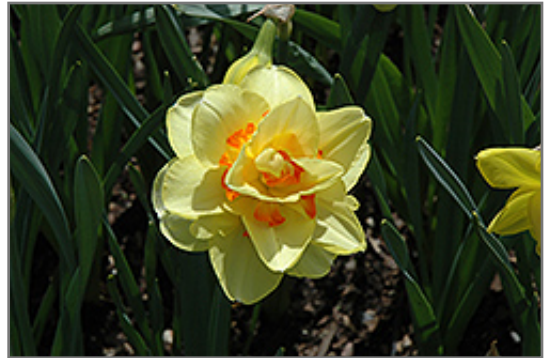
Tahiti Daffodil flowers