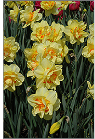
Tahiti Daffodil flowers

Tahiti Daffodil is recommended for the following landscape applications;