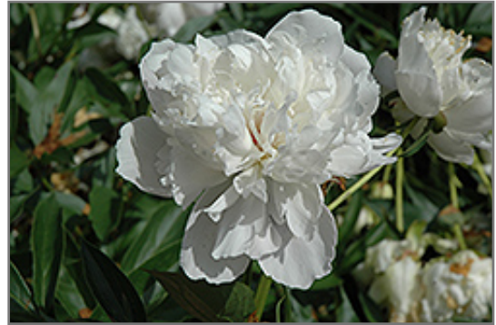
Adelaide E. Hollis Peony flowers