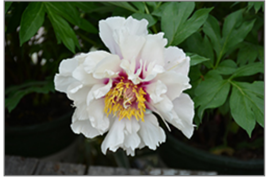
Cora Louise Peony flowers