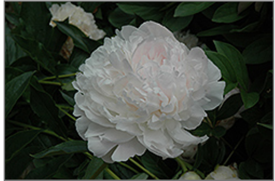
Cornelia Shaylor Peony flowers