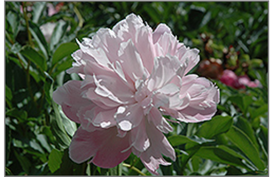
Edith Lyttleton Peony flowers