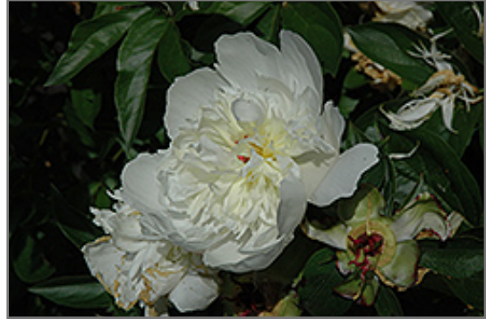
Frankie Curtis Peony flowers