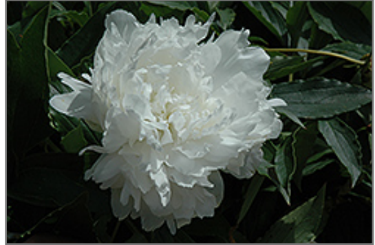
Jubilee Peony flowers

Loved for its huge double white blooms and nice fragrance; midseason blooming