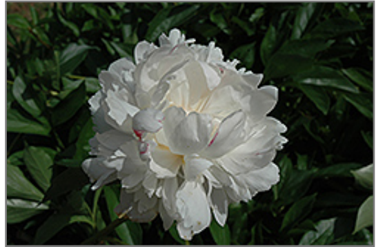
La Tulipe Peony flowers