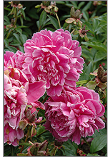
Lamartine Peony flowers