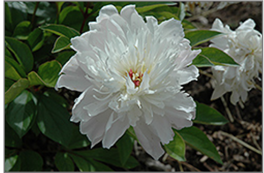
Miss Salway Peony flowers