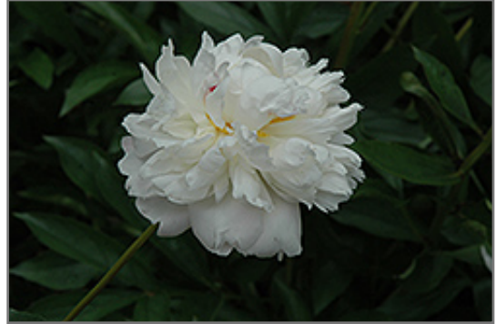
Mrs. C.S. Minot Peony flowers