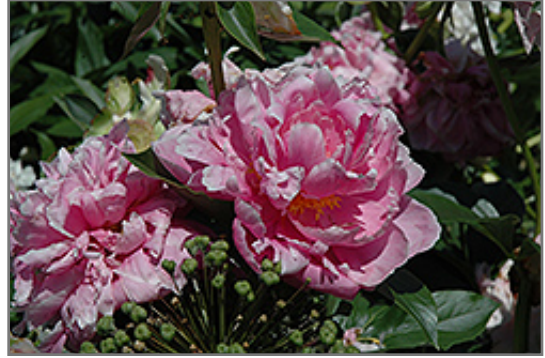
Rozella Peony flowers