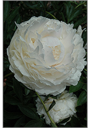
Solange Peony flowers