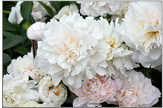
Solange Peony flowers