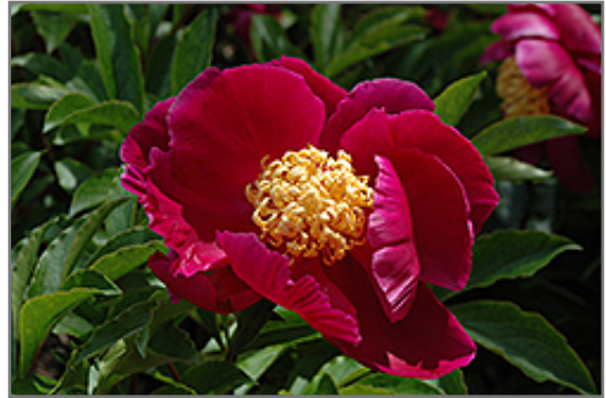
Some Ganoko Peony flowers