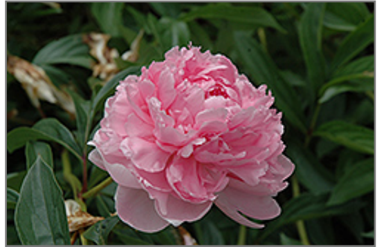
Walter Faxon Peony flowers