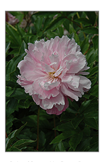
Duke of Devonshire Peony flowers

Duke of Devonshire Peony will grow to be about 30 inches tall at maturity, with a spread of 3 feet. When grown in masses or used as a bedding plant, individual plants should be spaced approximately 30 inches apart. The flower stalks can be weak and so it may require staking in exposed sites or excessively rich soils. It grows at a slow rate, and under ideal conditions can be expected to live for approximately 20 years. As an herbaceous perennial, this plant will usually die back to the crown each winter, and will regrow from the base each spring. Be careful not to disturb the crown in late winter when it may not be readily seen!