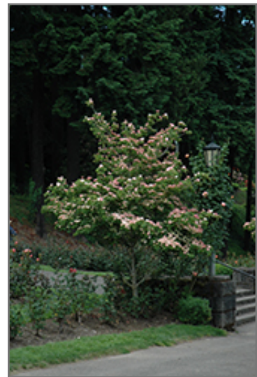
Heart Throb Chinese Dogwood in bloom