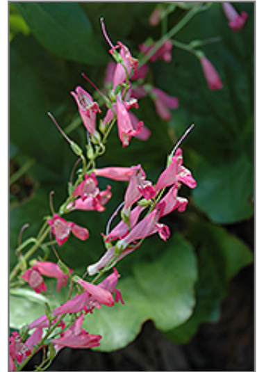
Rose Elf Beard Tongue flowers