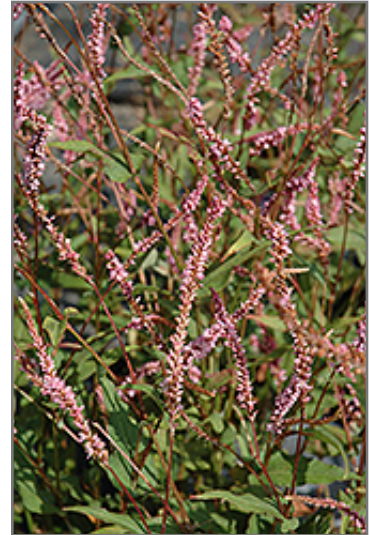
Pink Elephant Fleeceflower flowers

An easy to grow, long blooming perennial that produces loads of narrow, pink, bottlebrush spiked flowers for many weeks beginning in early summer; an interesting groundcover that displays color all season long