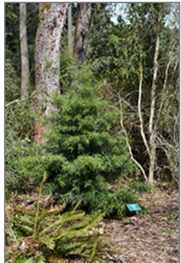
Willowleaf Podocarp