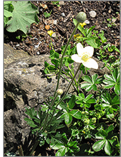
Yellow Alpine Pasqueflower flowers

A yellow form that produces a beautiful cluster of furry buds followed by large sulfur yellow flowers in the spring over the green fern-like foliage; an ideal rockery plant that improves with time if left alone