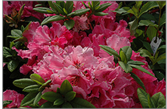
Hallelujah Rhododendron flowers

A stunning variety with amazing pink blooms accented with a contrasting dark red spots; an unusual showy accent plant; absolutely must have well-drained, highly acidic and organic soil, use plenty of peat moss when planting